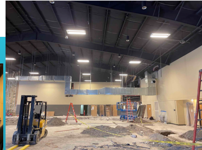
Overhead Duct Work