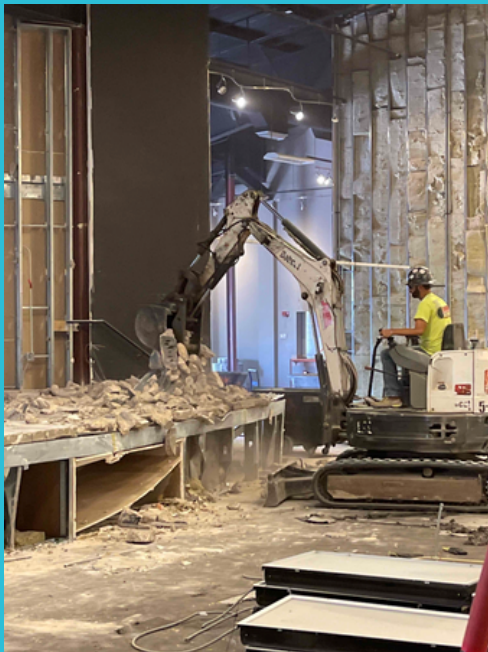
Demolition of the stage