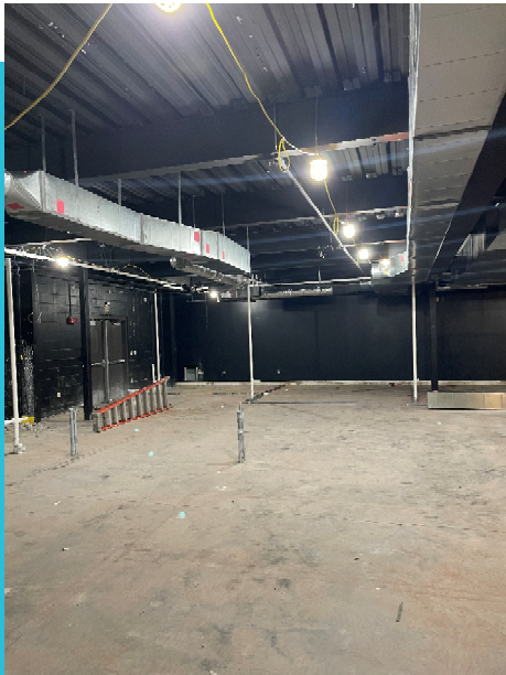
Duct Rough-in at old high school room