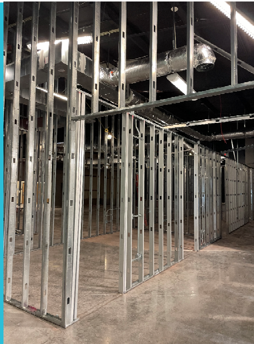
2 nd Level Wall Framing