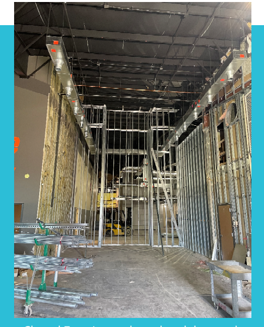
Chapel Framing and overhead ductwork