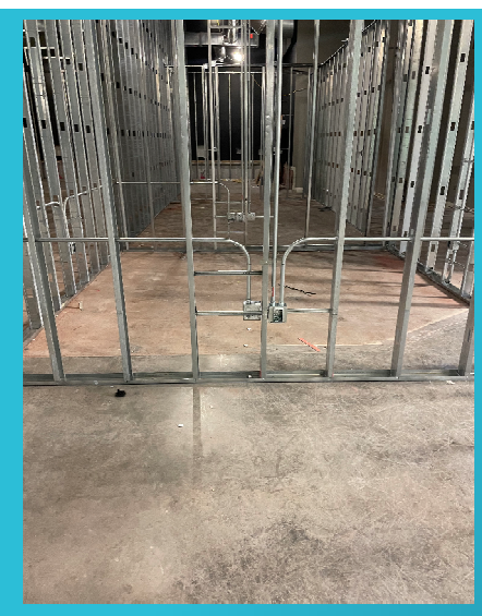
In-wall Electrical Rough-in