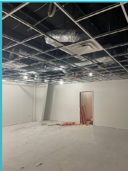
Ceiling Grid Installed